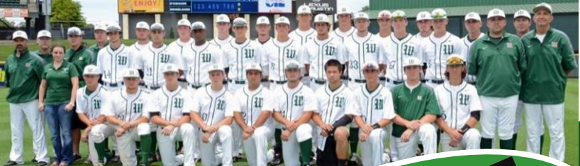
2013 State 5A Championship Team