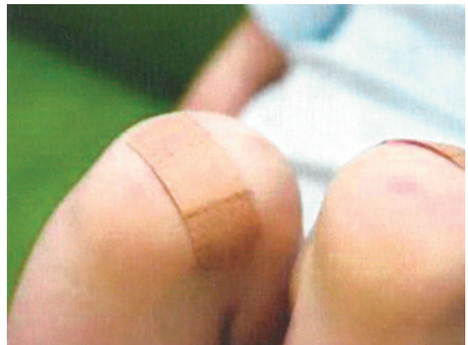
Montgomery County Youth Services

“The great use of life is to spend it for something that outlasts it.” — William James