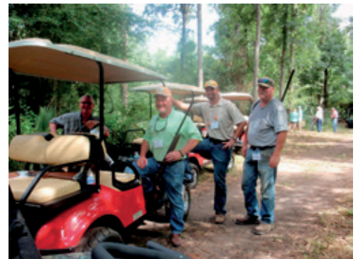
Huffco Shoot Out Team

Statement of Financial Position pp.13-14