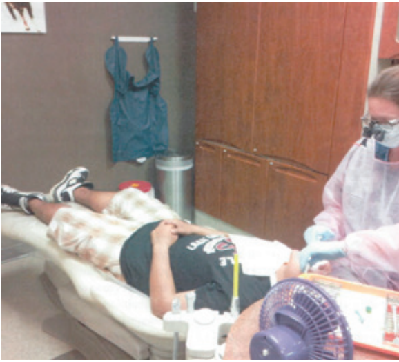
Lone Star Family Health Center