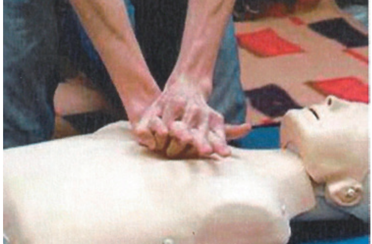
Montgomery County Youth Services