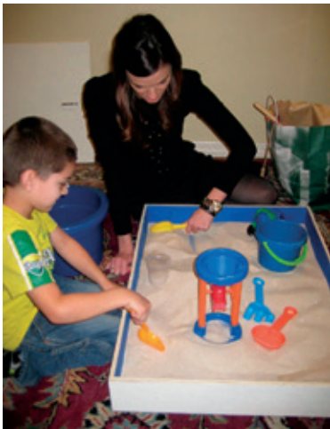
Montgomery County Women's Center