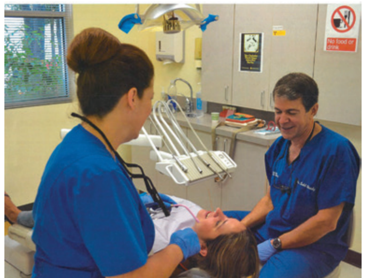
Interfaith Community Clinic