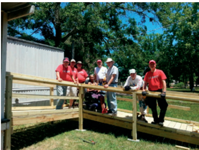
Montgomery County United Way Days of Caring