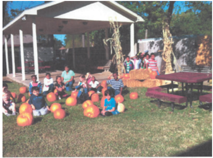
Tamina Community Center