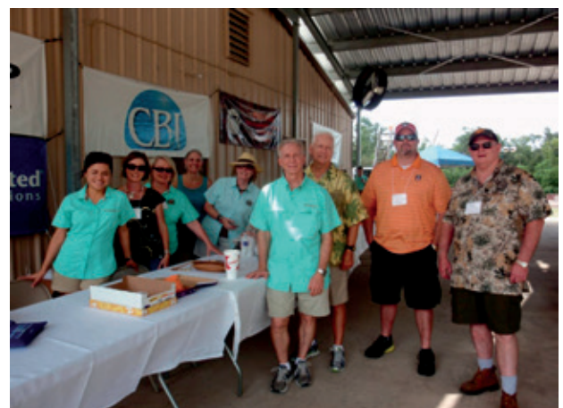
2014 Shoot Out Volunteers