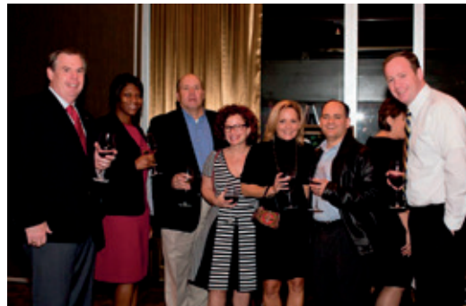
CB&I Table Guests at 2014 Wine Dinner