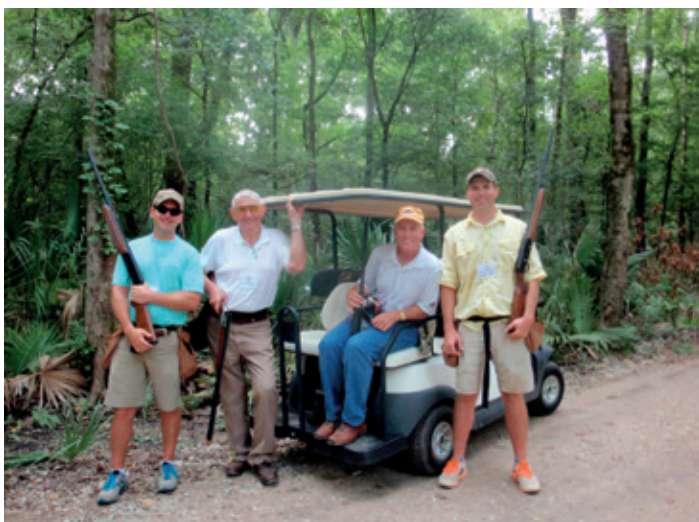
Edward Jones Shoot Out Team